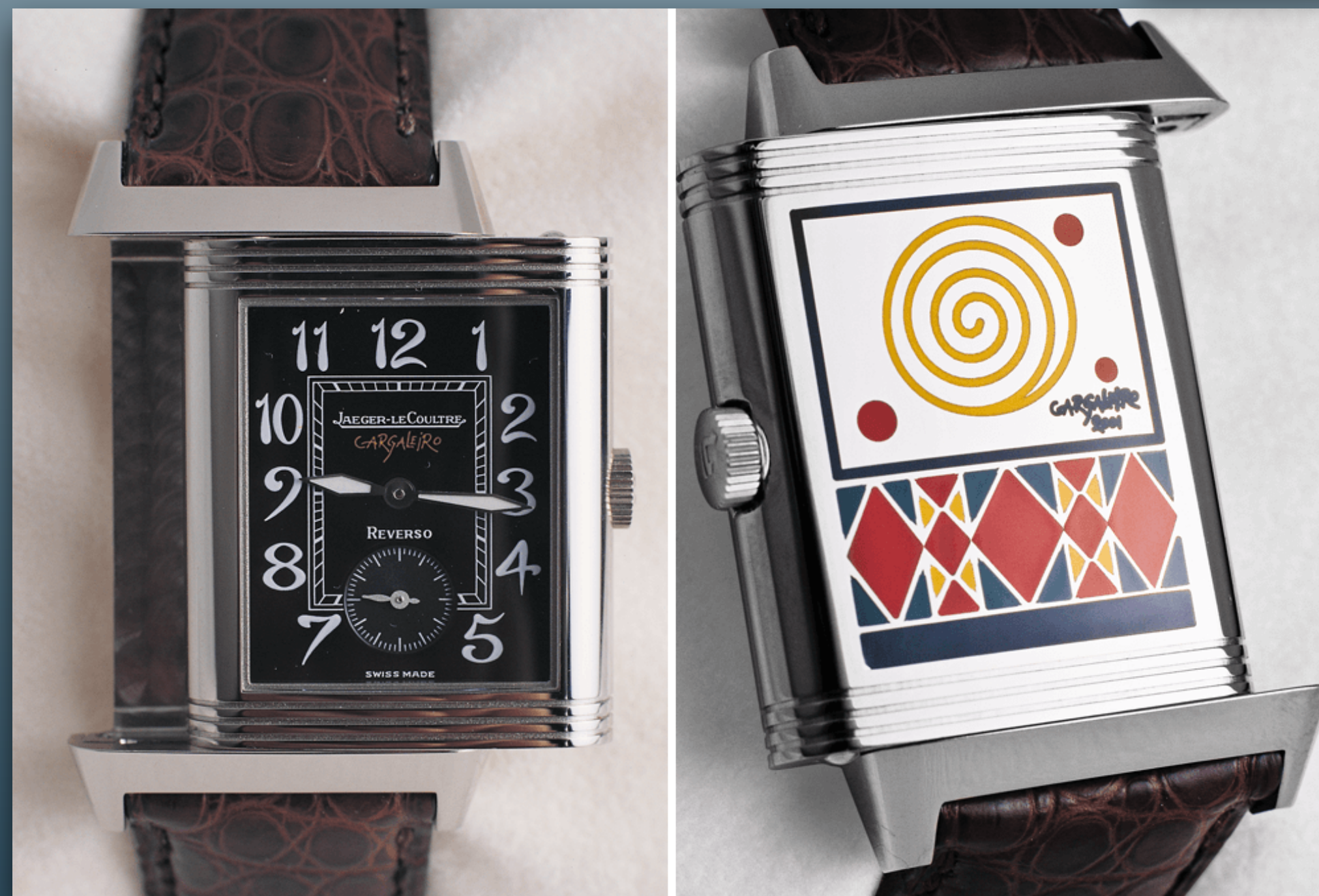
2001 Portuguese artist, Manuel Caraleiro LE 30 pieces