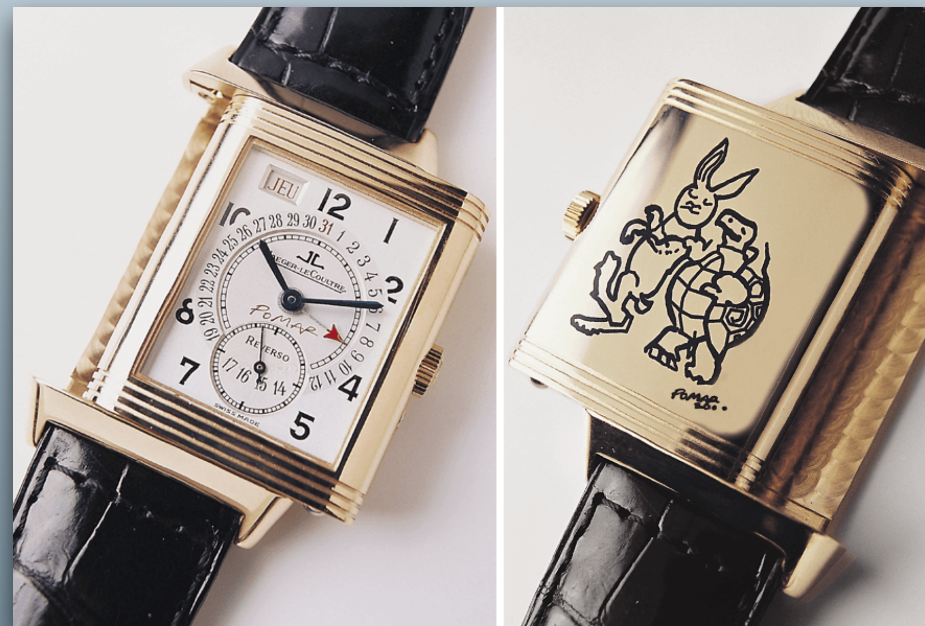
2000 Portuguese artist, Júlio Pomar, LE 30 pieces