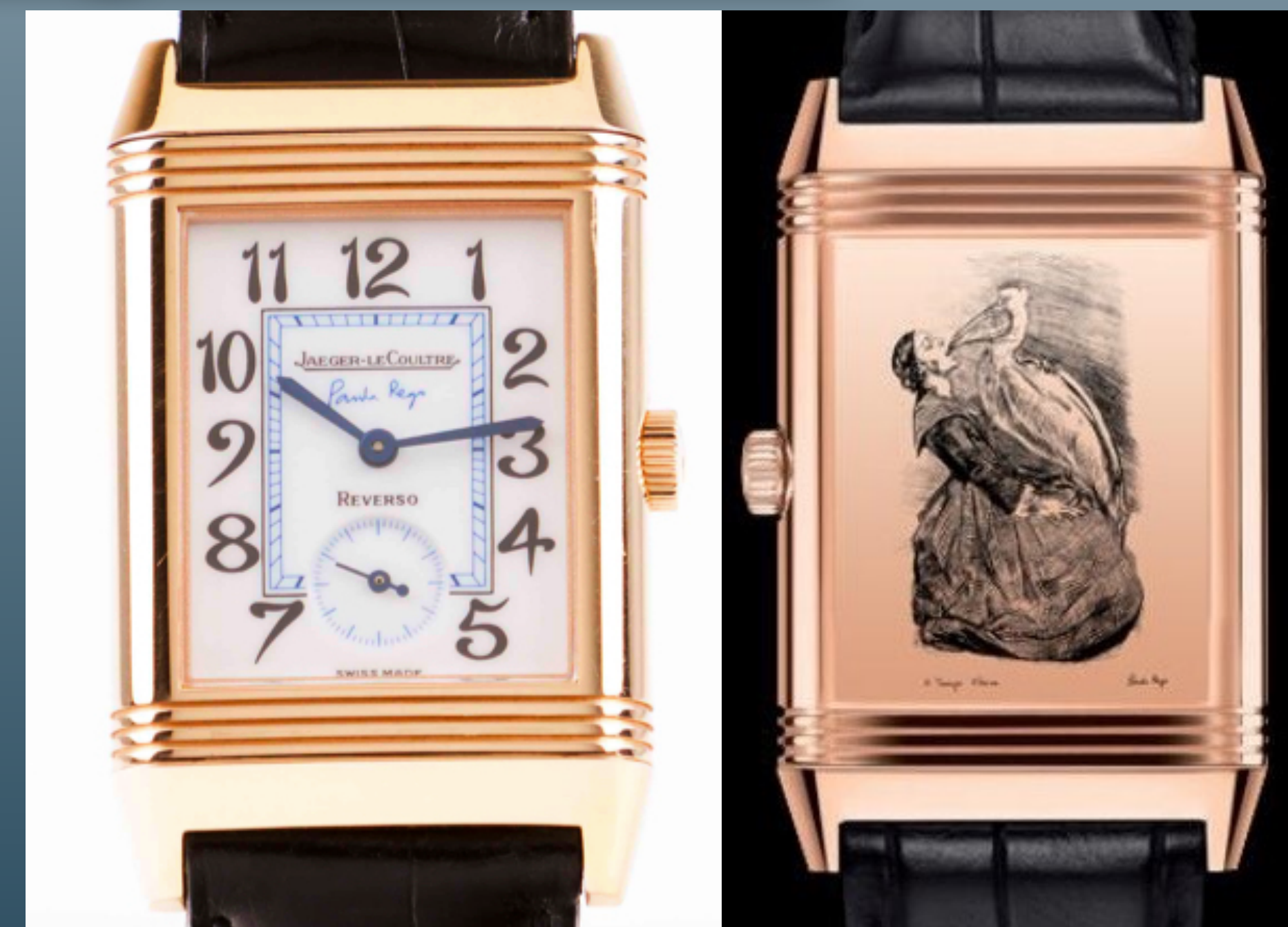
2002 Portuguese artist, Paula Rego LE 40 pieces